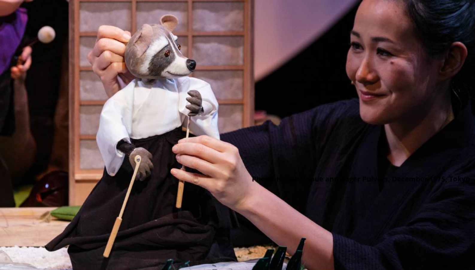
December 1975, Tokyo